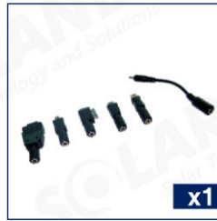
Phone Charger Adapters